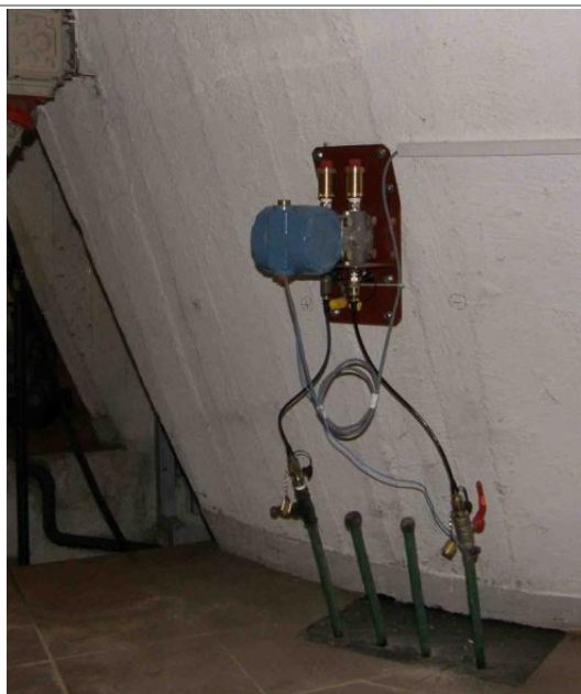
Fig. 2. Differential pressure transducer for continuous flow rate measurement equipped with the automatic venting system.